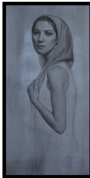
Blue scarf drawing